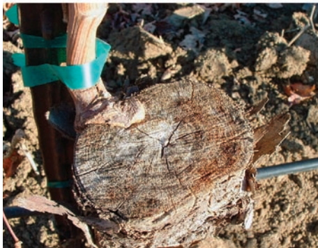
Top , Duration paint is being tested as a treatment for surgical cuts on grapevine trunks; lower , an untreated vine.

B. obtusa in 28% of asymptomatic shoots and 90% of symptomatic 1-year-old shoots ( n = 54 ) 3 inches from the cordon. Symptomatic shoots that were surface-disinfected and incubated in a humid chamber at 74°F for 3 weeks produced B. obtusa pycnidia. Overall, our data are consistent with a life cycle in which B. obtusa grows asymptotically within grapevine shoots and woody tissue. We postulate that damage to the vine occurs primarily by the grapevine's release of self-defense compounds that kill its own cambium.