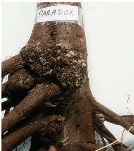
A 2-year-old walnut tree on 'Paradox' rootstock transplanted into soil infested with the pathogen Agrobacterium tumefaciens shows crown galls. Galls were primarily located at the sites of natural wounds such as root emergence, and were rarely observed on pruning wounds or cuts.