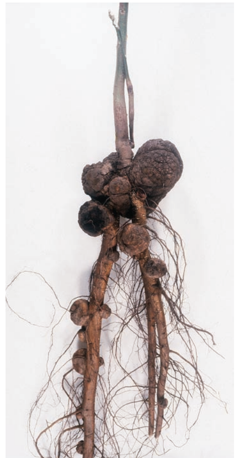
This budded walnut on 'Paradox' rootstock has both crown and root galls. Nurseries do not sell trees with visible galls, but may sell trees with roots that were in direct contact with galls and hence the pathogen.

Before planting, the Yolo County orchard site was fumigated with methyl bromide and chloropicrin, and transplants were treated with the biological control agent K84 (Galltrol, AgBioChem Inc., Orinda, Calif.). The San Joaquin County site, formerly planted with field and row crops, was not fumigated before planting and the transplants were treated with K84 before planting. In fall 2002, trees ( n = 119 to 127 per initial nursery-storage group) with galls that protruded above the soil were counted in both orchards. The Fresno County site was a nematode screening trial in soil amended with two species of nematodes that infect walnuts, Pratylenchus vulnus and Meloidogyne incognita . The