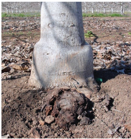
Some galls on the crown eventually break through the soil, but often are not visible in undisturbed soil until 3 or more years after infection. An application of the biocontrol agent K84 in the nursery and/or the orchard only prevents crown gall disease in certain situations, such as when the pathogen is exposed to and sensitive to K84.