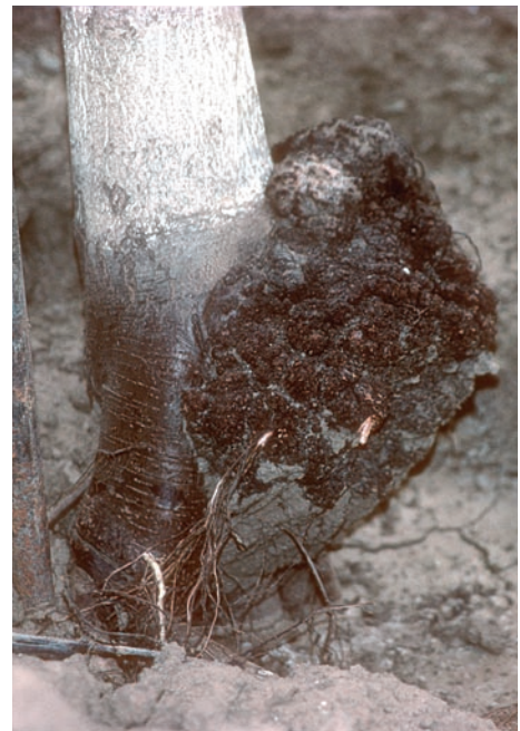
This 2-year-old tree on 'Paradox' rootstock had no gall and was treated with the biocontrol agent K84 at planting. Soil was removed from around the crown to show the gall. Circumstantial evidence indicates that the pathogen was acquired in the nursery.