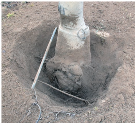
Severe crown gall in a young walnut orchard causes tree stunting and yield reductions. This gall was only visible after soil removal.