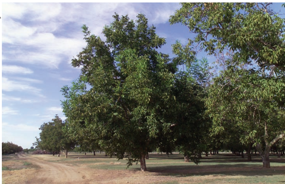
Most California walnut orchards are ‘English’ walnuts grafted onto ‘Paradox’ rootstock, which is highly susceptible to crown gall disease.